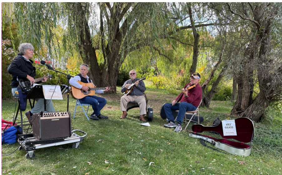
Wry Grass Band Playing at the '22 Fall Foliage Open House

Sunday, October 15, 2023 12:00 – 3:00 p.m.