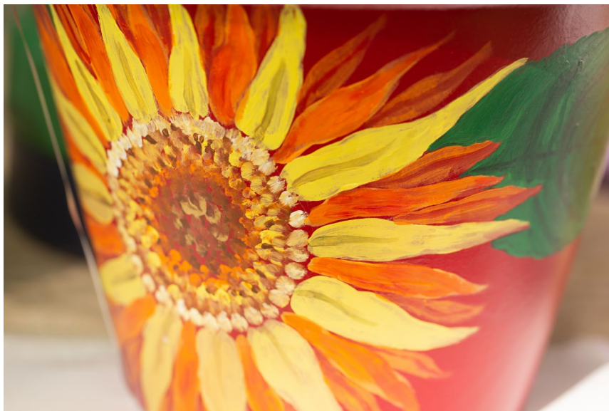
The talents you bring to Chadwick are numerous and multi-faceted.