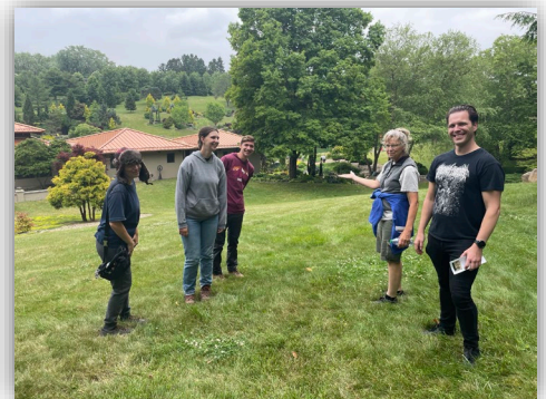
Staff visiting Schnormeier Gardens in Gambier, Ohio