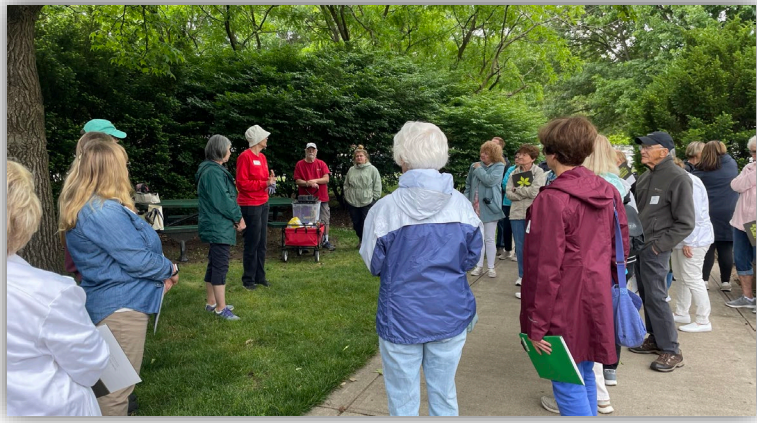
Horticulture Therapy Volunteers delighting a tour group

With freshly updated tour guide manuals, you do not need to be an expert to lead a tour – just give it a try! Some of our upcoming tours include: