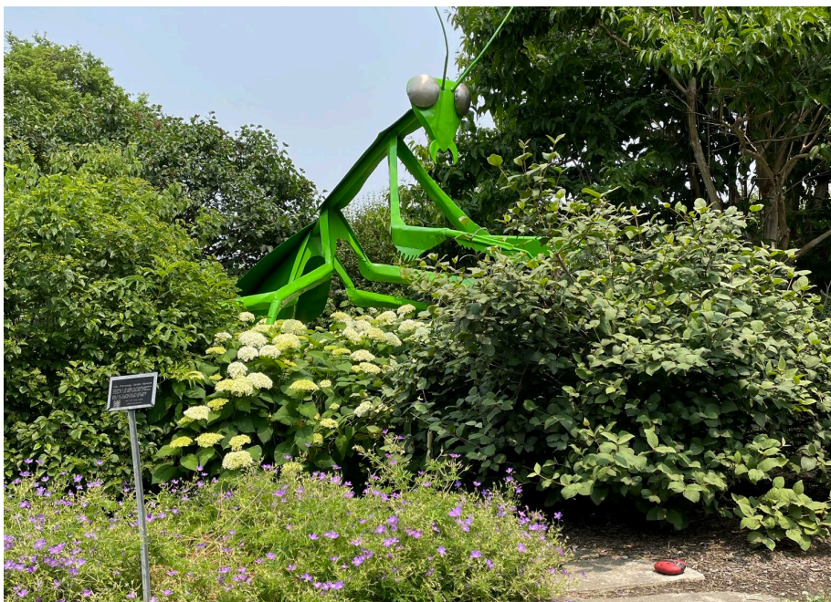
Annabelle in the Phenology Garden