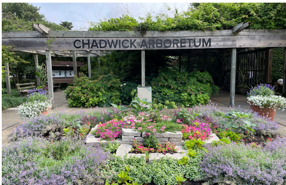
“The Trellis Entrance”

Here at the arboretum, we believe all volunteers should feel warmly invited, have fun, and get excited about the work we do together! A committee of volunteers who are helping to onboard new volunteers would help create the right environment we need to bring in and retain new people.