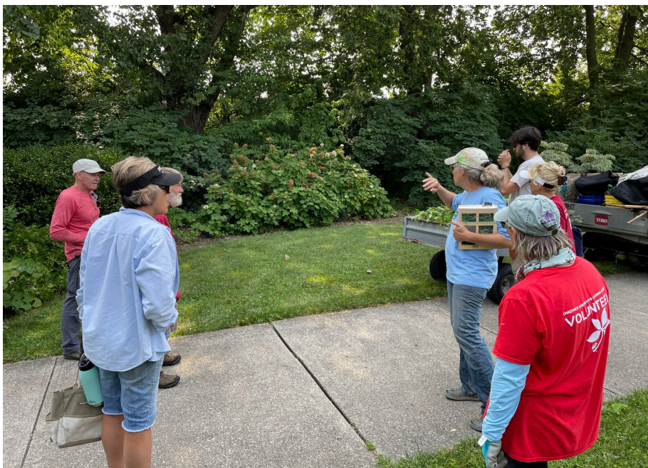
Lane Ave Volunteers taking a break for a learning moment.