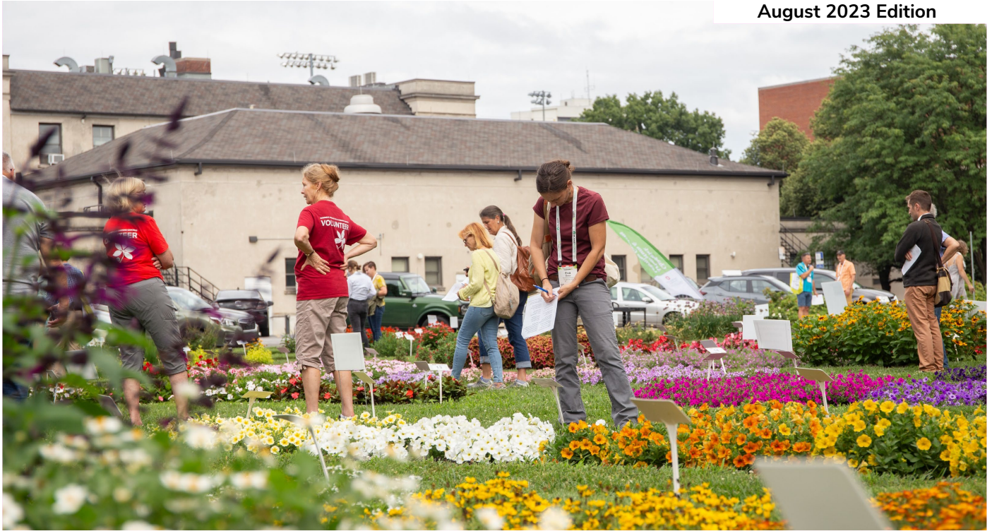
Cultivar Trials Showcase