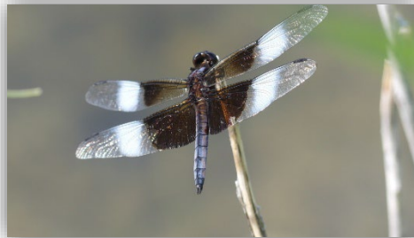
An iNaturalist observation of a Widow Skimmer