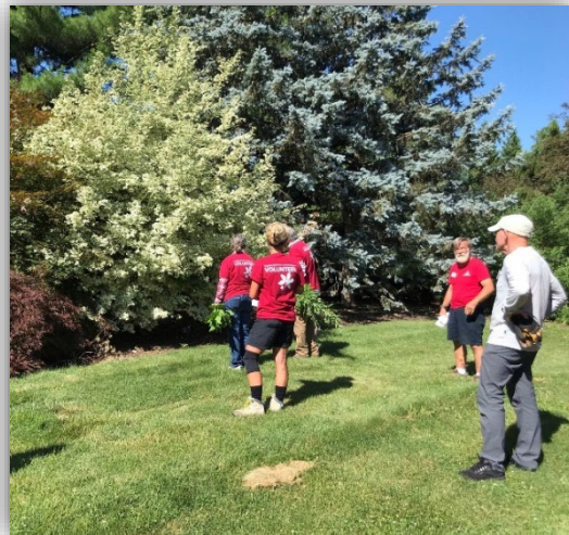
Lane Ave. Volunteers enjoying the Japanese Maple Collection