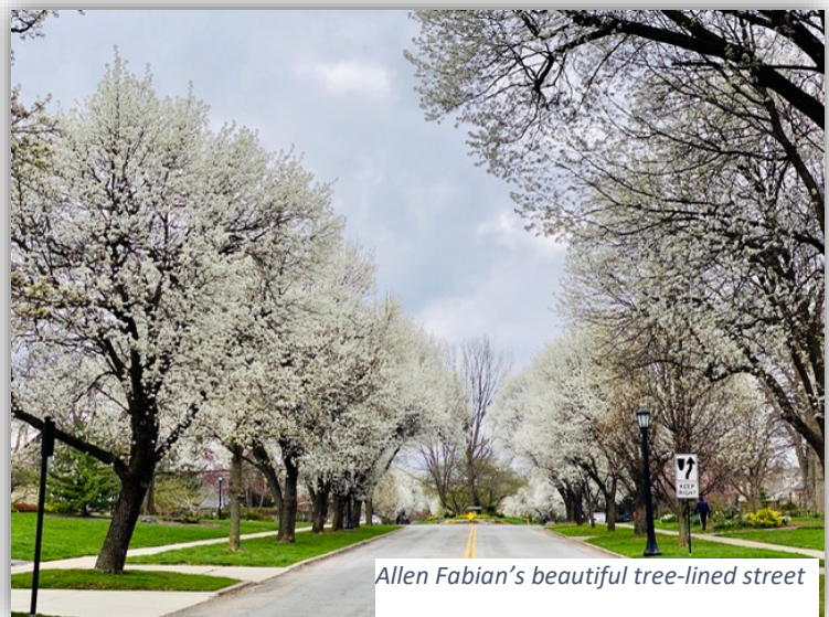
Allen Fabian's beautiful tree-lined street

https://ohio.volunteersystem.org/users/index.cfm