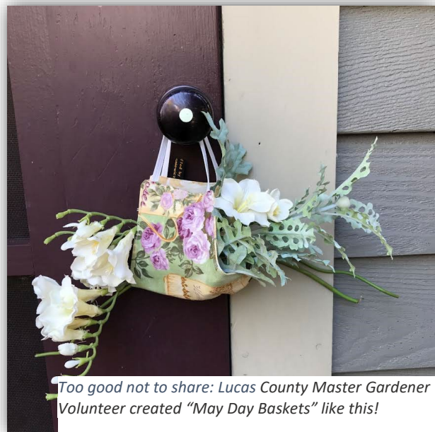
Too good not to share: Lucas County Master Gardener Volunteer created "May Day Baskets" like this!