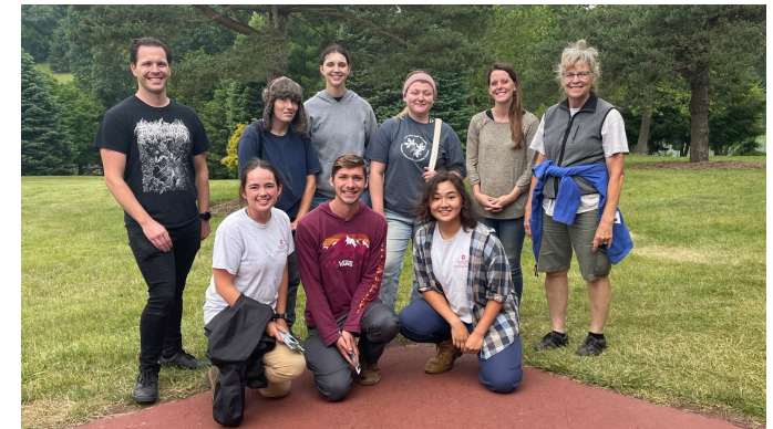
Operations and Programming Team