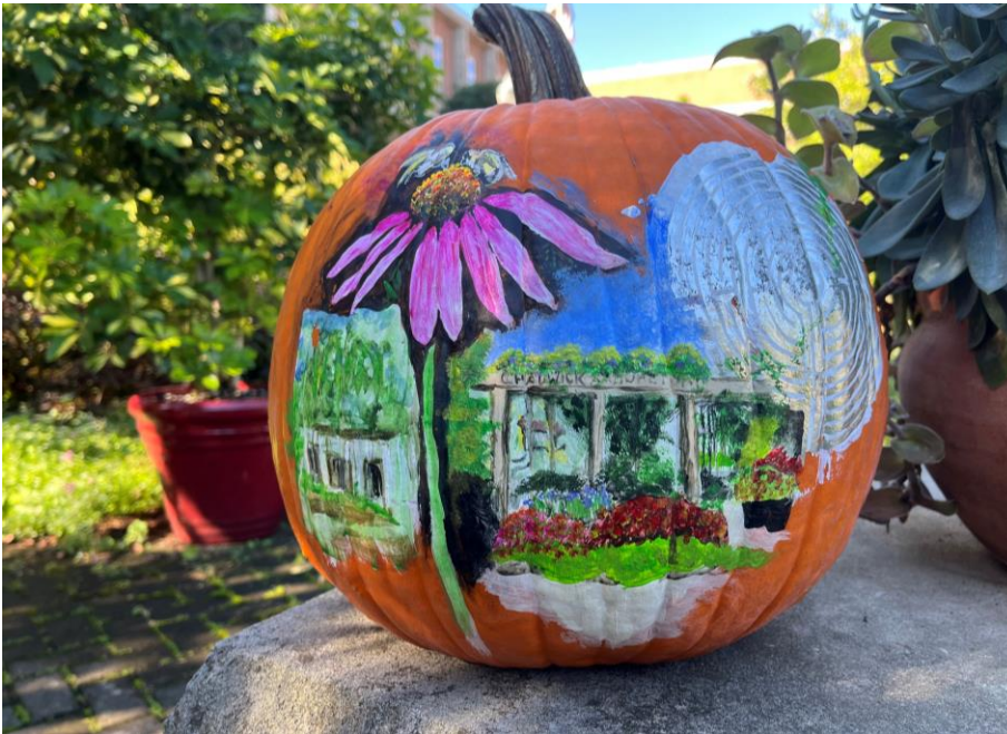
The Chadwick Arboretum Pumpkin. Painted by Rachel Tutera.