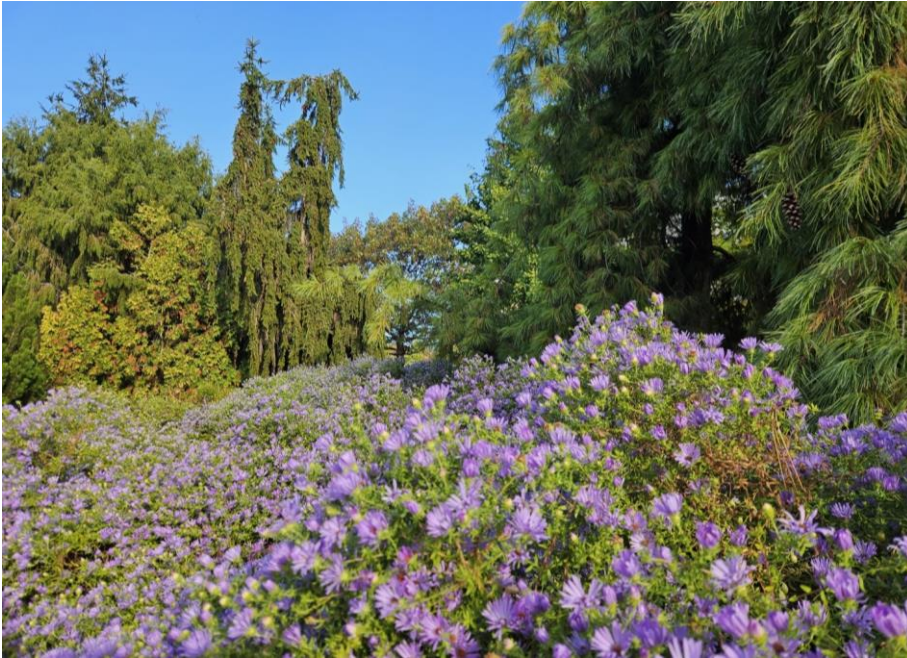
Asters blooming in Lane Avenue Gardens.