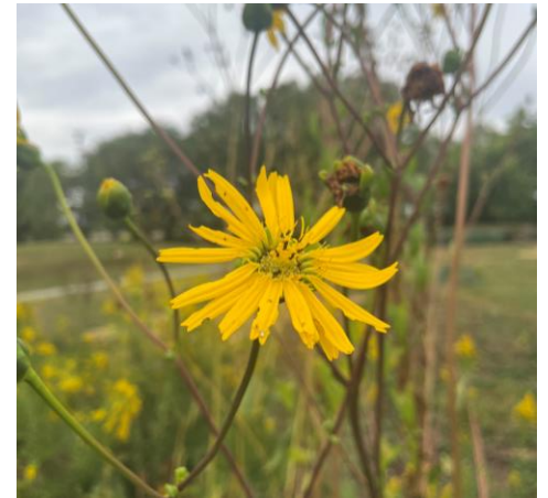
Wildflower in Arb North.

Join volunteer Joe Carter for a workshop all about processing and sowing native seeds over winter. We will use seeds collected at the arboretum