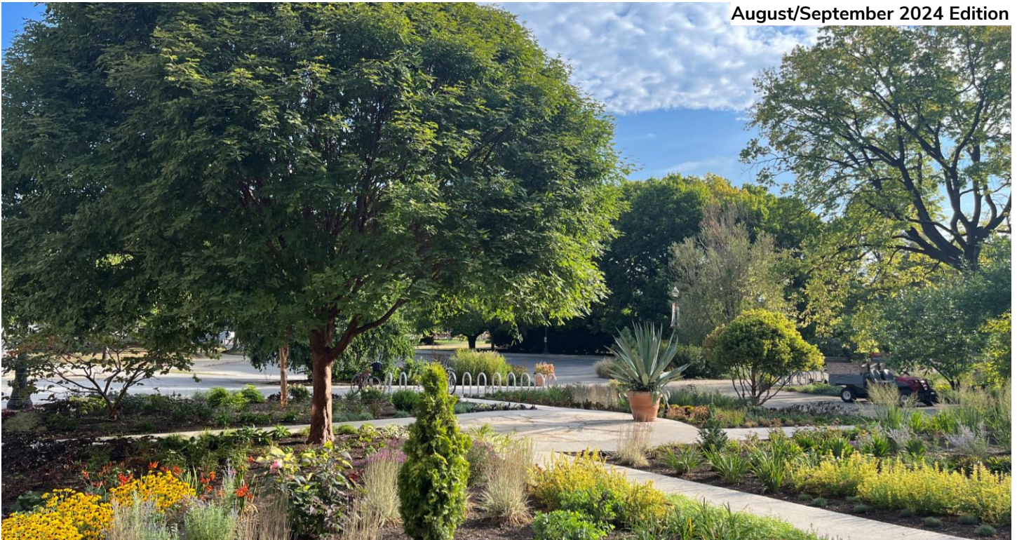
The finished Dr. Steven M. Still Perennial Garden in the sunshine.