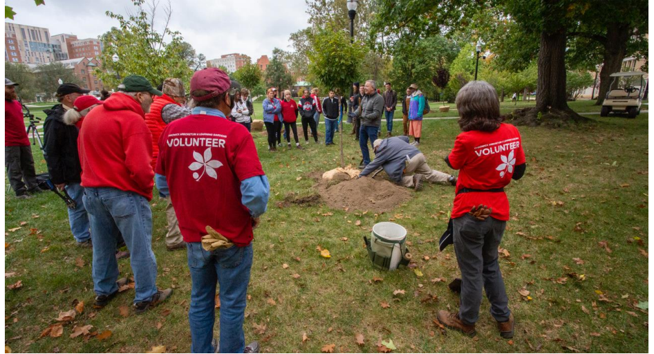
ArboBlitz 2021 on the South Oval

Here are some upcoming events to put on your calendar: