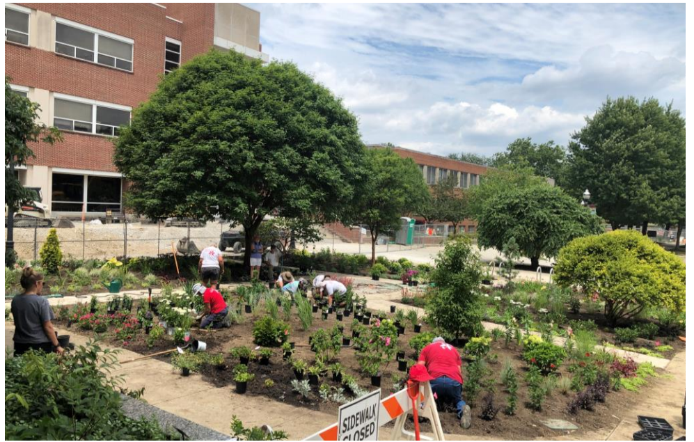
Volunteers hard at work installing the Still Garden.

We invite you to come out and visit this renewed garden, and to watch the ways it grows and changes over the years. Finally, we want to give a HUGE thank you to the volunteers who have helped at every step of this transformation process, from digging out and taking home the old plants, spreading compost and topsoil, planting, and maintaining the garden. This truly wouldn't have been possible without you!